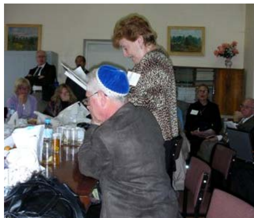
In the Town Hall: I am reading the compelling story of what happened in the Ivansk Cemetery the day before our people were cruelly expelled to their deaths.

I am in the Ivansk Town Hall, and I have been asked to read the " Funeral Document " in preparation for our walk to rededicate the cemetery [see: The Ivansk Project e-Newsletter #3, March-April 2004). I choke with tears at the part describing the slaughter of the children .