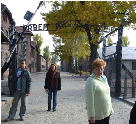
At the entrance to Auschwitz I “Arbeit Macht Frei” (Work Brings Freedom)

Auschwitz-Birkenau is a horrendous experience. I cannot believe that I have come to this terrible place where such monstrous things occurred. I imagine the indescribable pain, fear and despair felt by the unfortunate souls incarcerated here. It is hard to imagine that human beings were capable of such inhumanity, callousness and insanity.