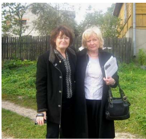
Our father's home once stood here.

I remember arriving in Ivansk and crying my eyes out. It was overwhelming to realize that my ancestors, my father's parents, his brothers and sisters all walked here. This is where I came from. Finding the place where my father's house once stood on the Road to Stazsow, across from the well; collecting stones to bring home with me; a chance encounter with a Polish man who knew my grandfather and who added inform-