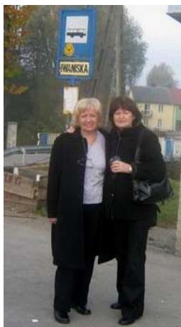
At the bus stop in Iwaniska

squeezed together with hundreds of lice-infested women. And worst of all, the gas chambers and the crematorium. It was enough to drive one mad.